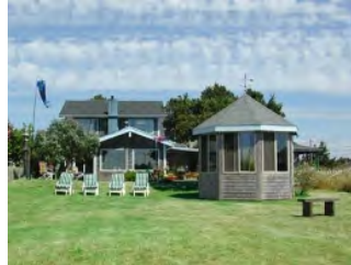
Bed and Breakfast Inn