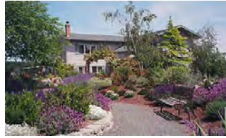
Trumpeter Inn Bed and Breakfast

Place The Wild Iris Inn , LaConner, 9th Place