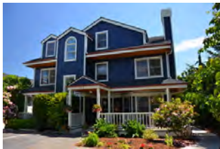
The Heron Inn and Day Spa

We are proud to add these two properties to our growing list of inns and B&Bs in Washington.