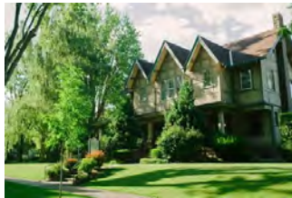
The Green Gables Inn